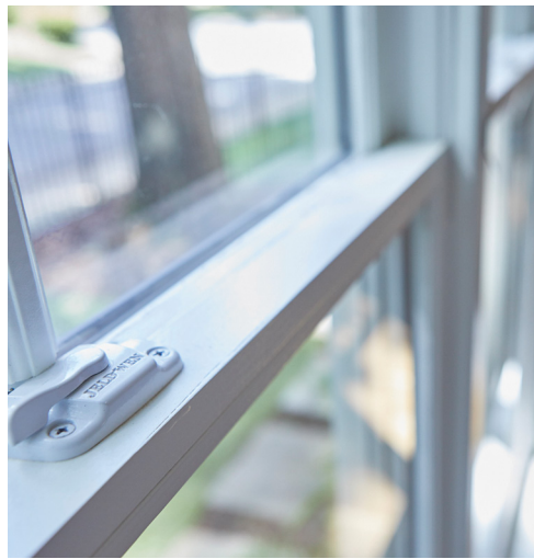
JELD-WEN® WINDOWS & DOORS | MAINTENANCE, CARE AND WARRANTY | 07